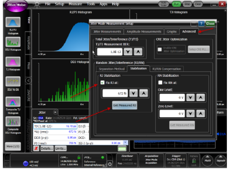
Figure 1. Locking the RJ value for long pattern measurements